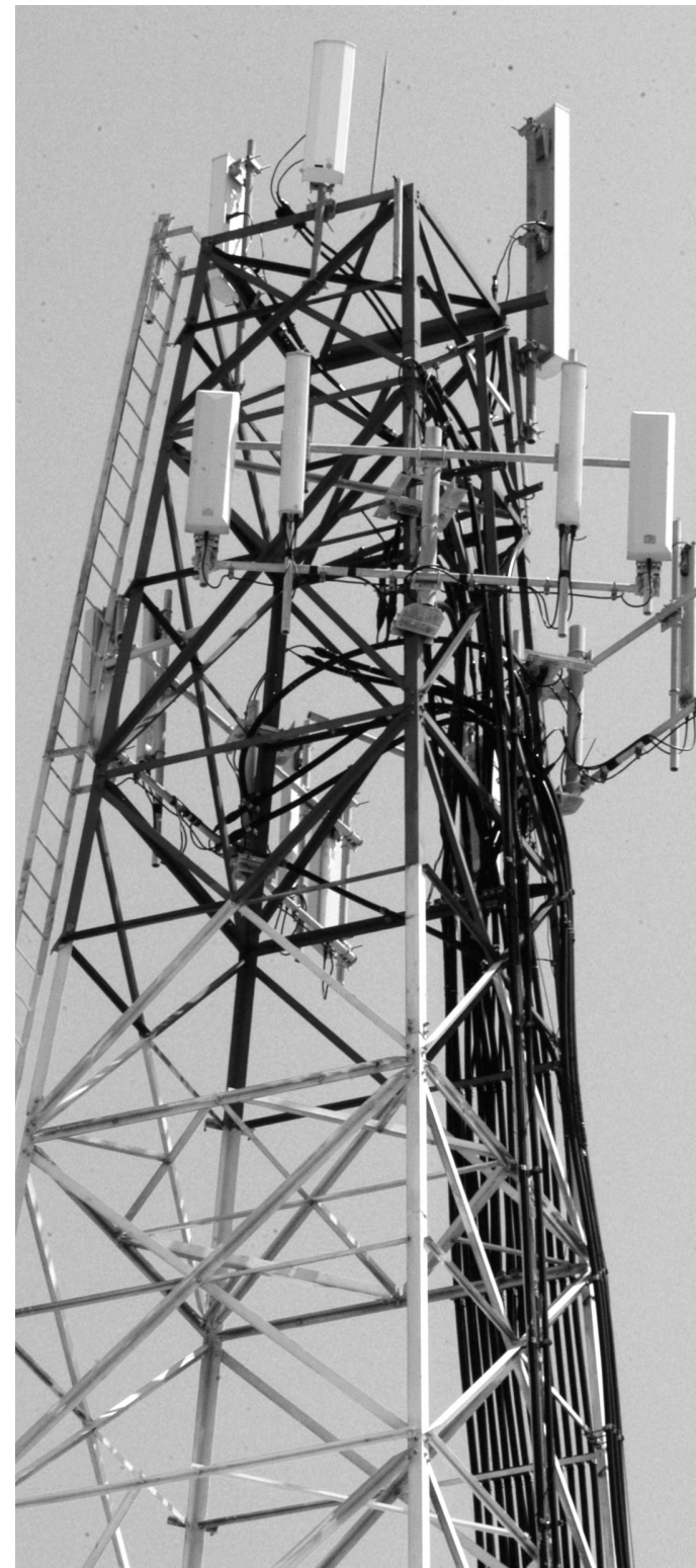
■ The URCA will have the authority to regulate the local telecommunications sector.

Pinnacle wrote off $4.5 million in the 4Q at the Emerald Bay casino because of the financial hardship, following the announcement of the Four Seasons' closure. The company requested and received permission to close the casino, which it did on January 2, instead of the previously announced closing date of August 31.