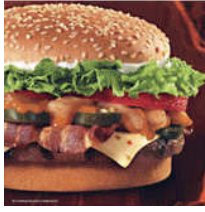
Burger King Freeport, Bahamas